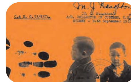
IDENTITY CERTIFICATE FOR BASIL CHONG c1933

FREE bookings essential phone 8839 3323 for more details or to book