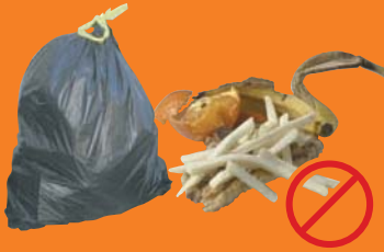
Household garbage and food scraps

بقايا الطعام النفايات المنزلية العادية 家庭垃圾 飯渣