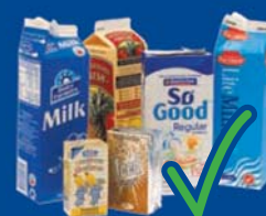
Milk and juice cartons