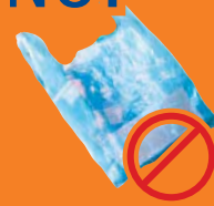
NO Plastic bags