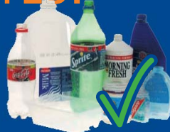
Plastic bottles and containers