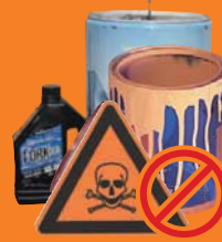
Hazardous and industrial waste

النفايات العضوية للحديقة جذوع الشجر والحطب السميك 花園有機物 樹樁或大木料