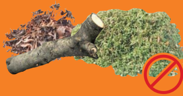
Garden organics and oversized stumps and logs

بقايا الطعام النفايات المنزلية العادية 家庭垃圾 飯渣