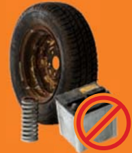
Cars, car batteries and car-parts

نفايات تتسبب بخطر النفايات الصناعية 危險垃圾 工業垃圾