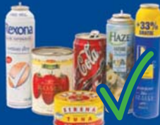
Steel, aerosol and aluminium cans

علب معدنية، علب الرش والألمنيوم 鋼罐、氣霧罐和鋁罐