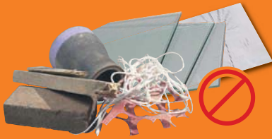
Building materials and plate glass