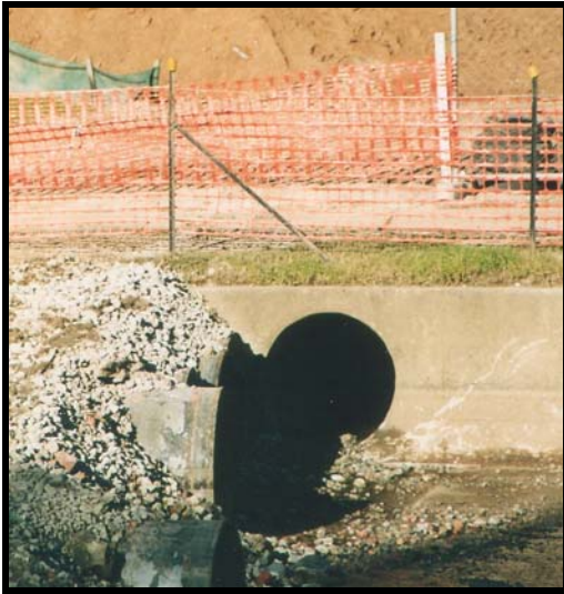
Photo 6 stormwater pipe outlet adjacent to reconstruction works for the pedestrian footbridge

The land use is heavily dominated by office accommodation with a small section of Arthur Phillip High School at the southern end.