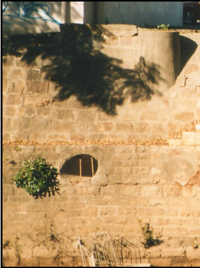
Photo 3 Outlet of stormwater pipe downstream of car park

This catchment is located south of the river bounded by George Street to the south, Marsden Street to the west with the eastern boundary lying between Marsden Street and Church Street. It takes in the sealed car park at the rear of the shops on the west of Church Street comprising about 25 per cent of the total catchment area.