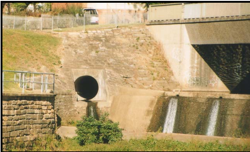
Photo 2. Stormwater outlet pipe draining the Westfield Catchment with the Marsfield Bridge in Background

Stormwater is discharged via a 1650mm pipe east of the Marsden Street Bridge. However the drainage maps are not able to clarify the location of this trunk drain from the vicinity of George Street. It is assumed it passes beneath the Hospital grounds providing possibly an ideal location for an inline treatment device.