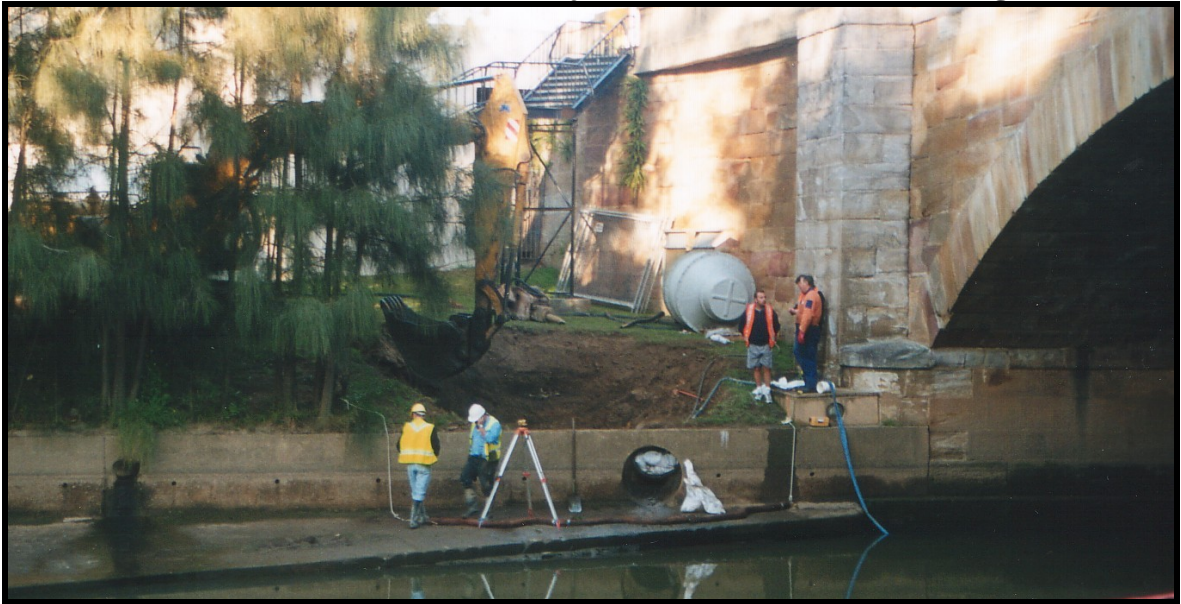
Photo 4. Installation of the CDS device adjacent to the Lennox Street Bridge

Small scale planting of street trees are proposed to line Church Street in this catchment.