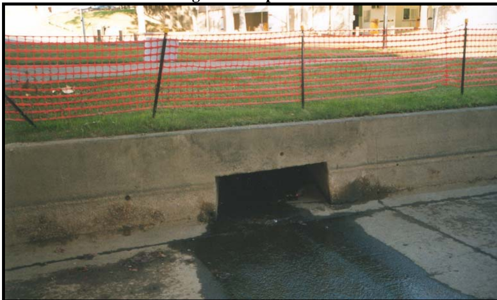
Photo 5 Box culvert draining the Phillip Lane and CBD catchment

It contains mostly office space accompanied by ground floor retail and food premises and contains a multi-storey car park.