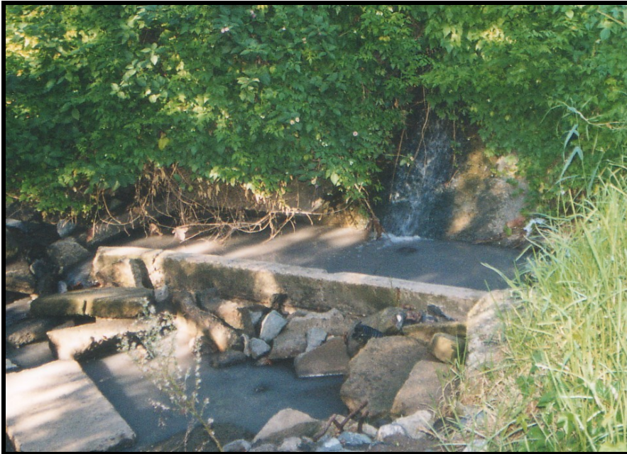
Photo 7 Stormwater outlet from Arthur Phillip High School catchment adjacent to the Parramatta River

The outlet of this pipe is downstream of the ferry terminal beyond the current access path and heritage walk. A 3-metre retaining wall adjacent to the river bank has been constructed to protect against flooding which limits public access to the outlet by vehicles.